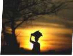
02 Sunset in Islamabad