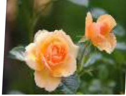
07 Rose Flower