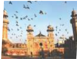
11 Wazir Khan Mosque, Lahore