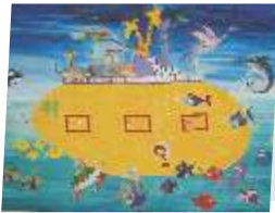
18 By Cancer Patients