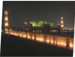
09 Badshahi Mosque, Lahore