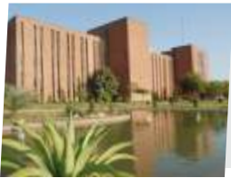
17 Lakeside View