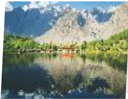
14 Shangrila Resorts, Skardu