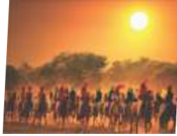
03 Tent Pegging in Punjab