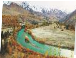
13 Gupis Valley Gilgit