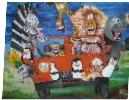
19 By Cancer Patients