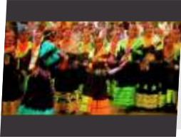
01 Festival in Kalash