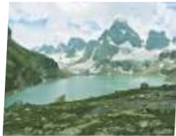
15 Lulusar Lake, Kaghan